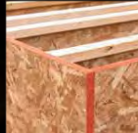
LP® SolidStart® Rim Board