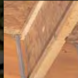
LP® SolidStart® I-Joists