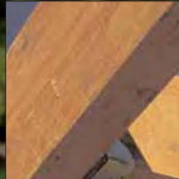
LP® SolidStart® Laminated Veneer Lumber (LVL)